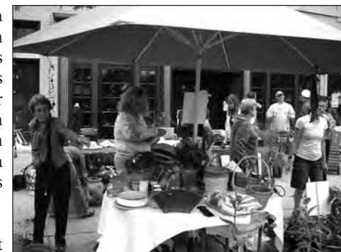
Onlookers browse through the wonderful assortment of items for sale at the annual “Garden of Treasures Sale and Fundraiser.”

For further information on the Rogers Park Gardening Group visit their website at rogersparkgardeninggroup.org