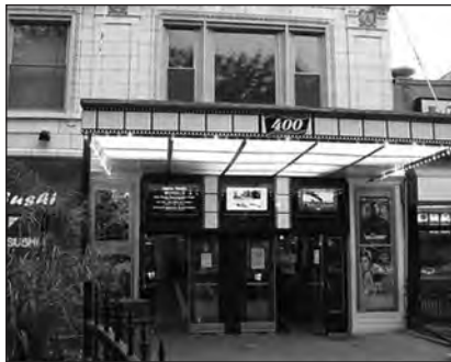
Once the 400 Theater, then the Village North, now returns to its original name of simply “400.”

The movie theater formerly known as the 400 Theater is once again the 400 according to the new owner, Anthony Fox of CDF Capital.