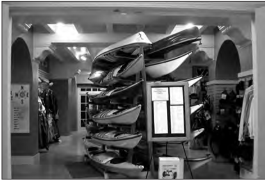
Interior of the Geneva Kayak Center, 7301 N. Sheridan Road.