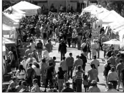
The crowds attracted to the 8th Annual Glenwood Arts Festival reached a record high 15,000 for the two-day event.