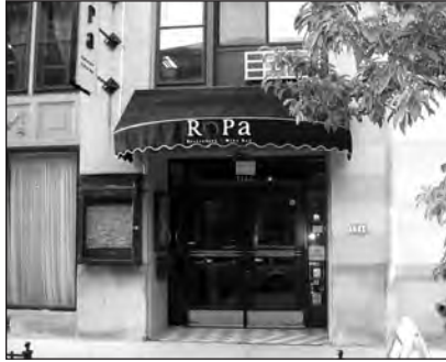
(Above) This handsome sign beckons passersby to partake of the food and drink of the RoPa restaurant, opened last year on Pratt Blvd., just east of Sheridan Road. (Below) Interior shot of the RoPa Restaurant.

Reservations are suggested but not required. RoPa is located at 1146 Pratt Blvd., just east of Sheridan Road. The phone number is (773)508-0002 or you can check them out on their website at www.roparestaurant.com .