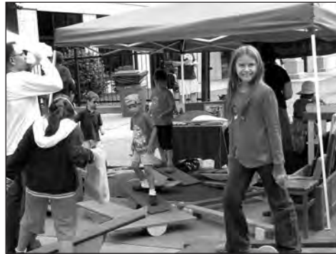
Food vendors were scattered throughout the Fest.

were three live stages, featuring 48 musical acts.