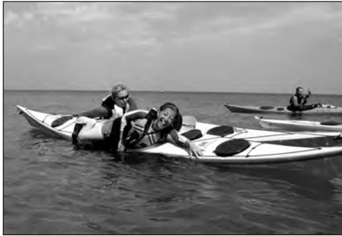
Typical of the kayaks to be seen with increasing frequency in Lake Michigan is this scene of a kayaker plying her skills.