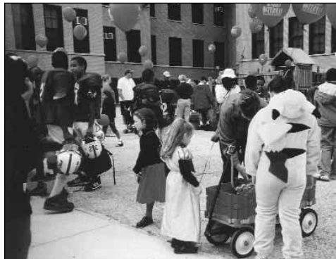
Part of the Labor Day Parade entourage which wound up at Gale School for soft drinks and refreshments. The RPBG co-sponsored the event.